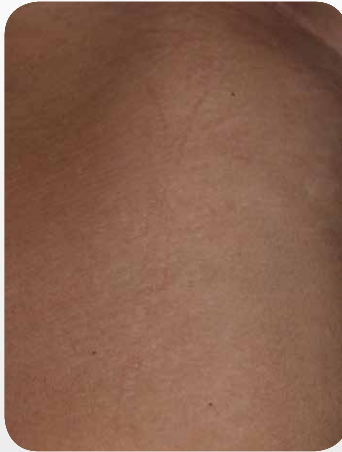
3 months after 3 treatments, with 1 month between treatments